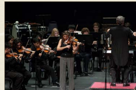
World-renowned violinist Nadja Salerno-Sonnenberg performed with the FSYO during the 10-11 season.

Want to experience what the FSYO is all about? Trying to figure out which orchestra you should audition for? Attend our Open House Rehearsal on Sunday, March 20 from 2:00 to 5:00 pm to see our orchestras in action and learn more about our program. Conductors, orchestra managers and students will be available to answer your questions at the break. More information and directions will be available at www.fsyo.org or call the office at 407.999.7800 with your questions.